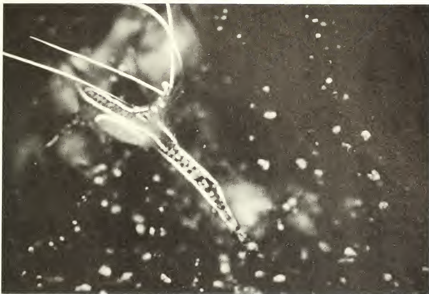
Fig. 3. Periclimenes pedersoni at Bonaire.

color pattern typically included a large dorsal "saddle" of pure white or pink, tan or green with a white border on the dorsal surface of the carapace, (seen in 31 shrimp, or 44% of the total), a saddle (sometimes in a figure-eight pattern) of similar color on the dorsal surface of the first and/or second abdominal somite (seen in 30 shrimp, or 42% of the total), and a large saddle on the third abdominal somite (seen in 46 shrimp, or 65% of the total). The tips of the uropods often were marked with white and dark spots shaped like eyespots; however, the tail fan was visible in only 21 photographs. The lower surface of the carapace or abdomen often had spots of white or white and dark pigment and the anterior parts of the cephalothorax could be speckled; however, it was difficult to see these marks in many photographs. Many shrimp also had "saddle" marks on the fourth abdominal somite, or had marks that overlapped two abdominal somites. Two of the largest shrimp (total body length approximately 30 mm, as estimated from photographs) had a body background color of brownish pigment; most